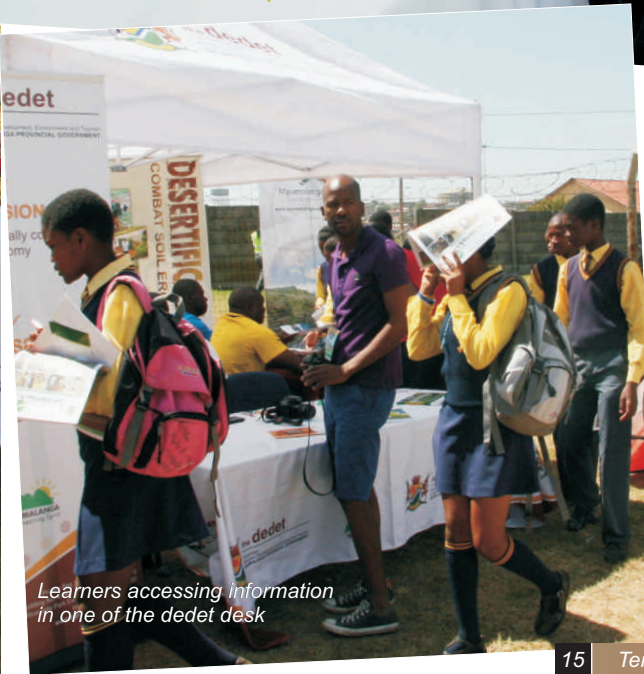
Learnners accessing information in one of the dedet desk