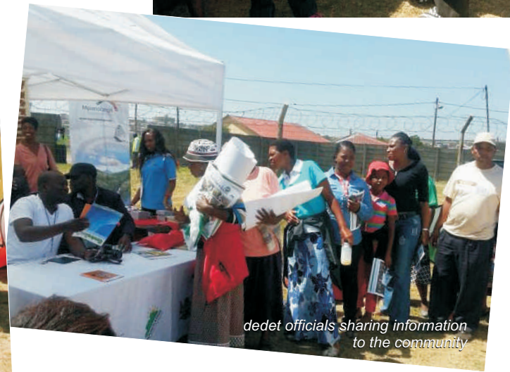
dedet officials sharing information to the community