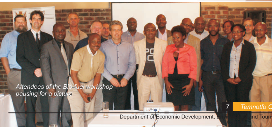
Attendees of the Bio-fuel workshop pausing for a picture