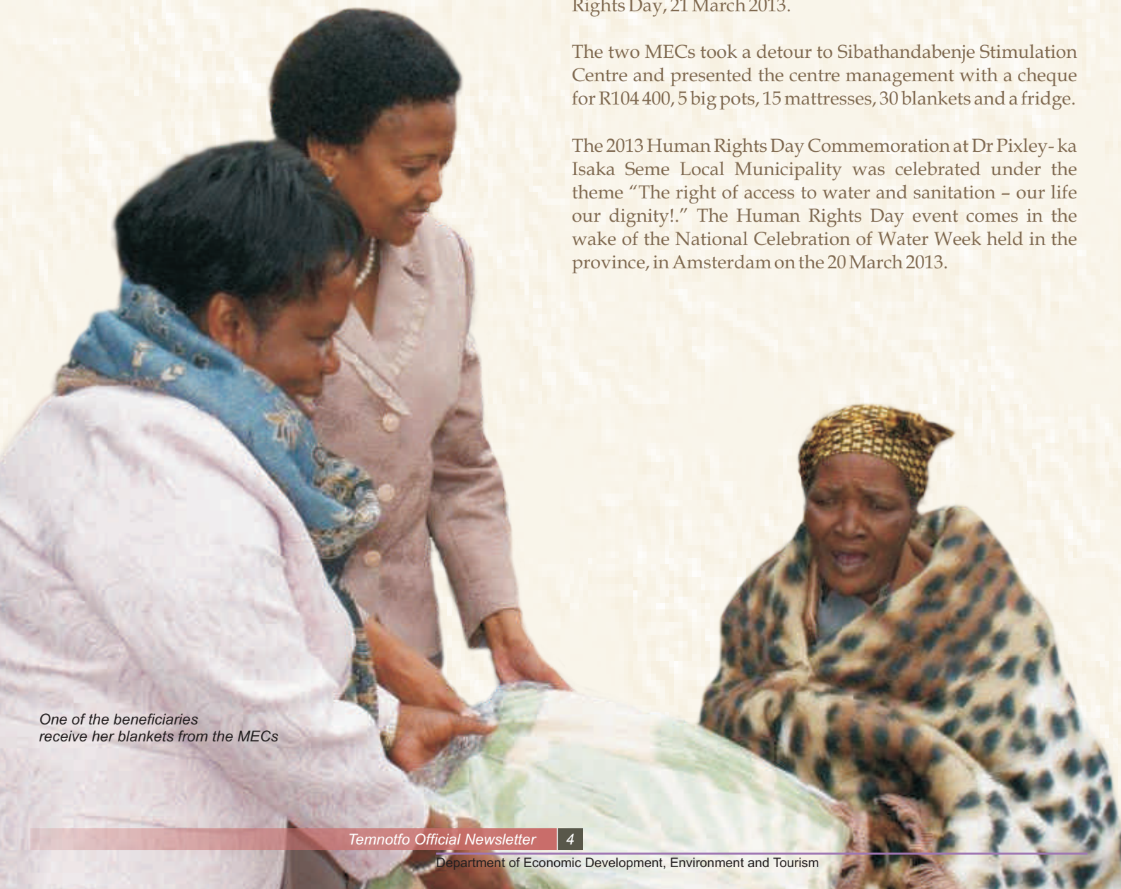
One of the beneficiaries receive her blankets from the MECs

The 2013 Human Rights Day Commemoration at Dr Pixley-ka Isaka Seme Local Municipality was celebrated under the theme "The right of access to water and sanitation - our life our dignity!." The Human Rights Day event comes in the wake of the National Celebration of Water Week held in the province, in Amsterdam on the 20 March 2013.